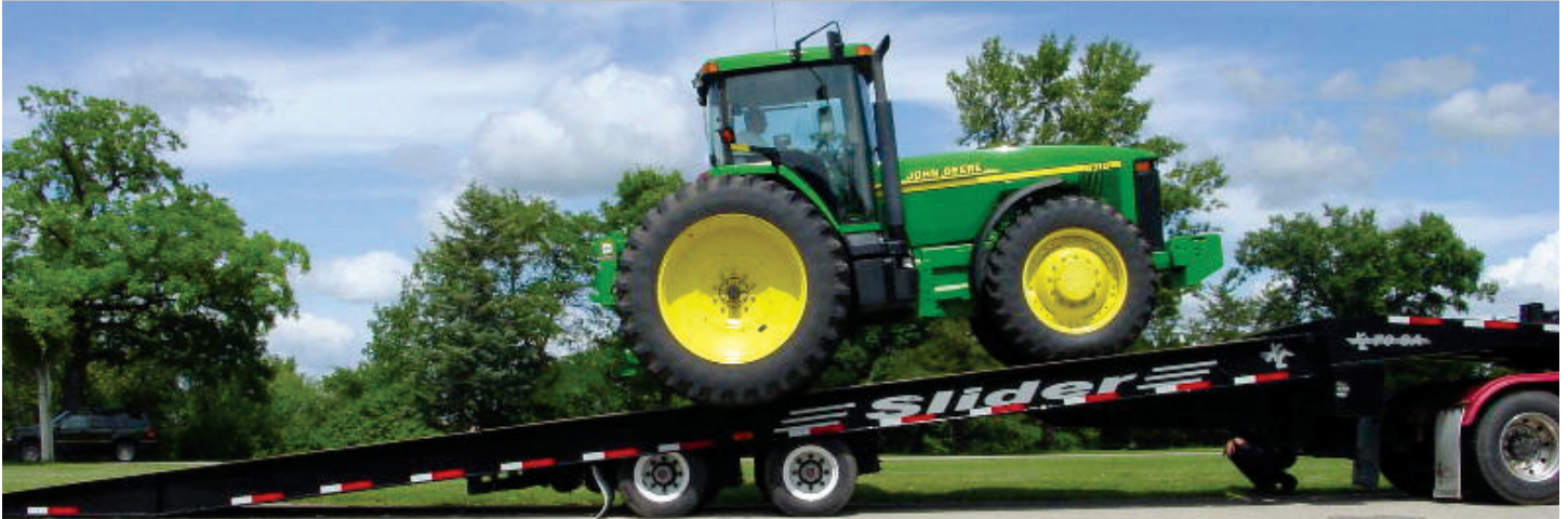
XL 70 Slide Axle (Slider)