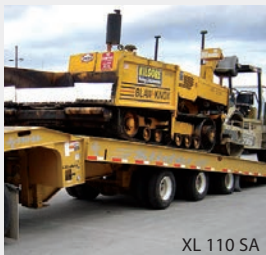
XL 110 SA

The XL Slider features an extended dump angle of 17 degrees and improved hydraulics to keep your equipment from unnecessary wear. Hydraulic sliding axle assembly with traveling bumper provides under ride protection.