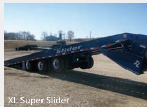
XL Super Slider