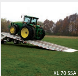
XL 70 SSA

A 6½ degree load angle permits you to easily load pavers and rollers, while the winch at the front loads inoperable equipment. A single 2 stage cylinder provides maximum travel and minimal maintenance .