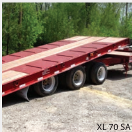
XL 70 SA