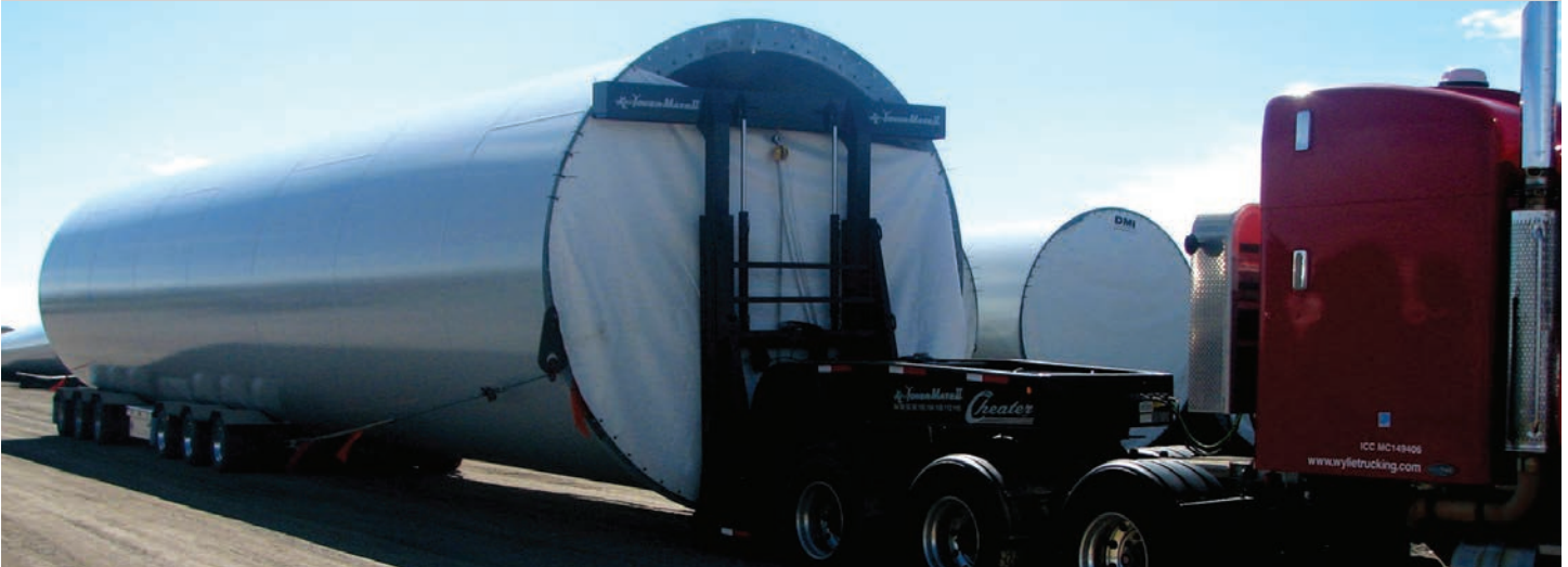
XL 140 TowerMate II